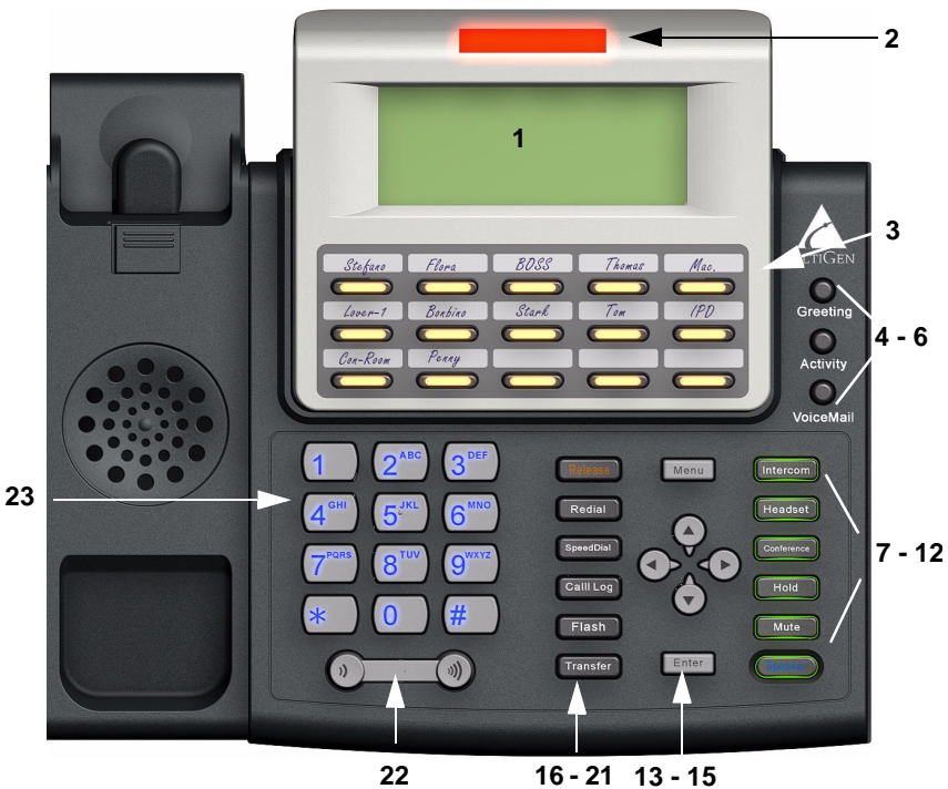
Figure 1. IP 720 Phone

The main components of the phone are illustrated in the figures below and described in the table that follows each figure.